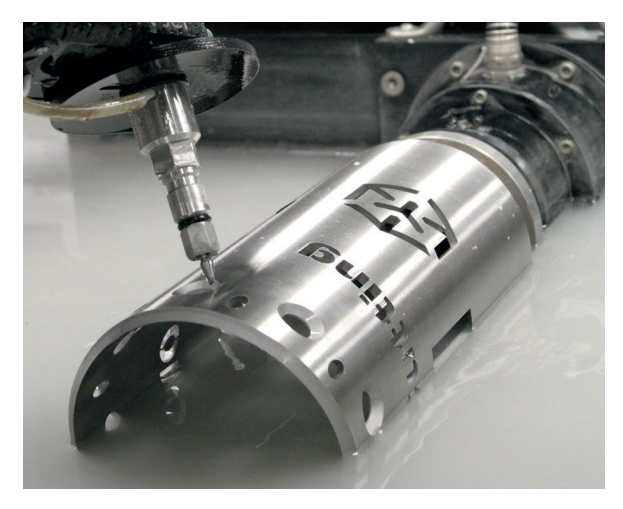
When used with the A-Jet, fishmouth intersections, saddle cuts, and countersunk holes can be cut along the circumference of pipes.