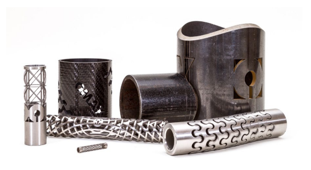
The Rotary Axis can handle small and large diameter tube and pipe with high precision, as well as nonmetal tubing.