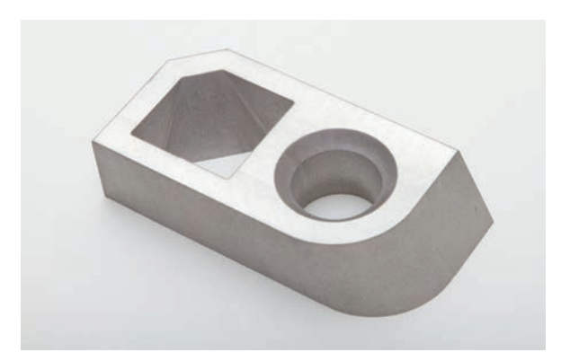
The A-Jet makes cutting bevels simple, and software controls help to eliminate taper.