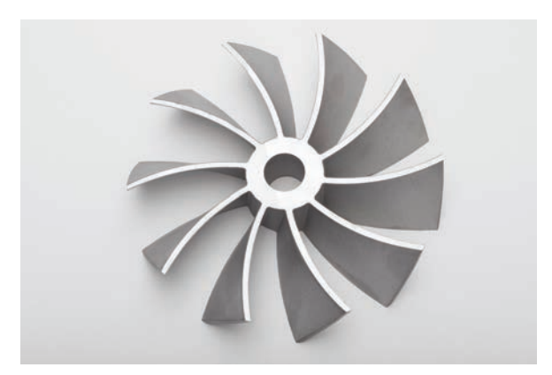
Precise and complex three dimensional parts become a reality with the OMAX A-Jet.